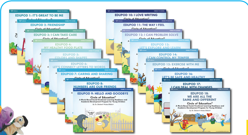
18 EduPod Thematic Units