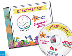
SONGS & MUSIC