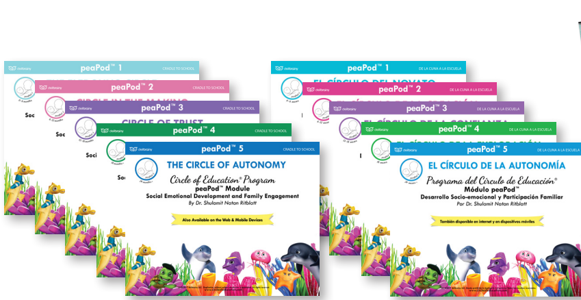
5 PEAPOD THEMATIC UNITS