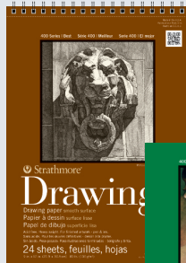
400 Series Drawing Smooth pad cover