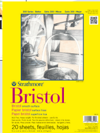
300 Series Bristol Smooth pad cover