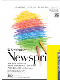
200 Series Newsprint pad cover