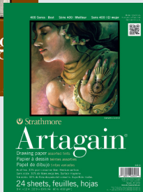
400 Series Artagain Assorted pad cover