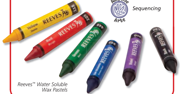
Reeves™ Water Soluble Wax Pastels