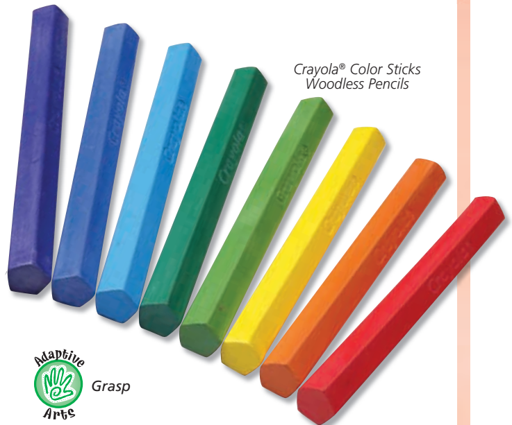
Crayola® Color Sticks Woodless Pencils