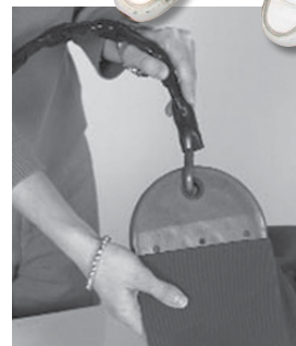
fig 2. Slide swing bottom through with chains still attached.