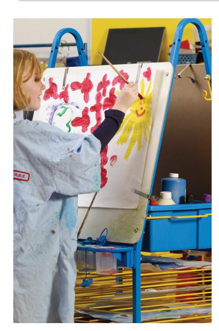
Early Learning Station (ELS1)