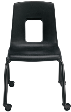
Black Powdercoat Frame