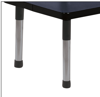
Unique Apollo legs adjusts in 1" increments from 18 5 / 8 " – 27 5 / 8 " high