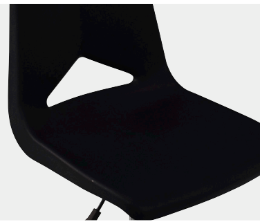
Optional Seat and Back Pad