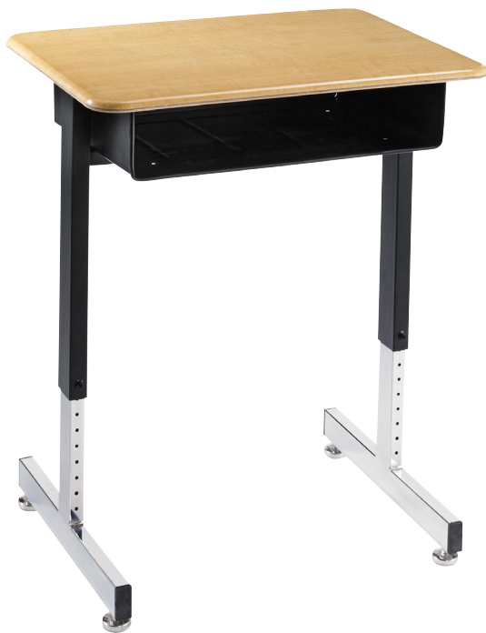
Hard Plastic Top with Book Box