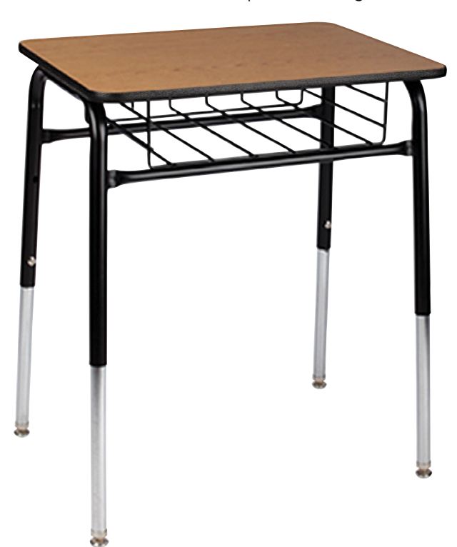
20 x 36 ADA Compliant Top