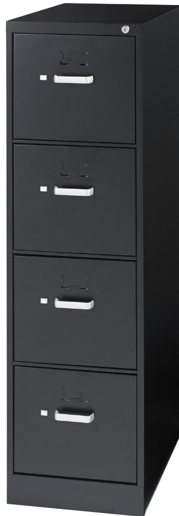
4 Drawer - Black