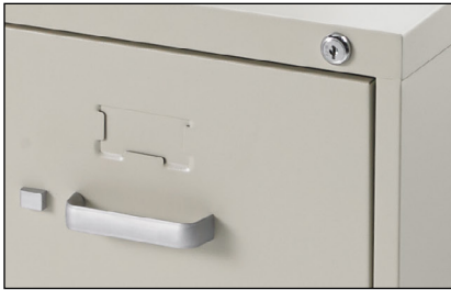
Removable Core Lock With Aluminum Drawer Pull, Label Holder and Thumb Latch