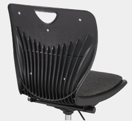
15 Contoured Ribs Provide Flexibility and Added Strength