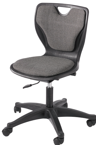
Shown with Optional Back and Seat Pads