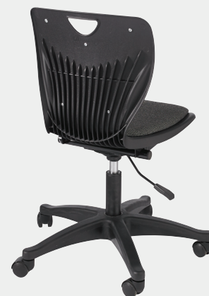
15 Contoured Ribs Provide Flexibility and Added Strength