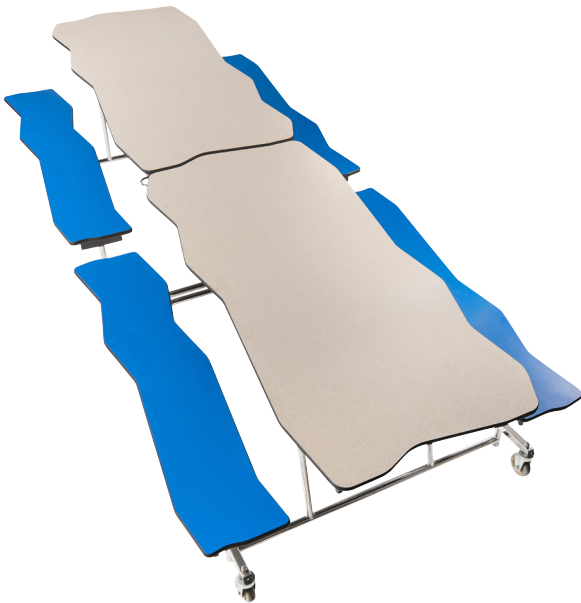
Wiggle™ Table with Benches and Chrome Frame