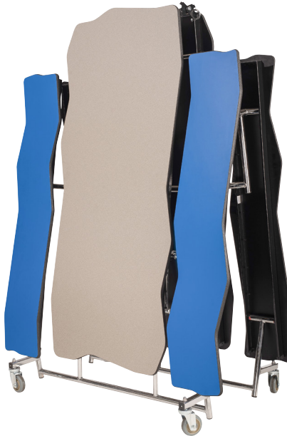
Wiggle™ Table with Benches Folded with Chrome Frame