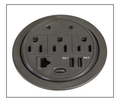
Center mounted power station features 3 AC outlets, 2 USB ports and an Ethernet jack