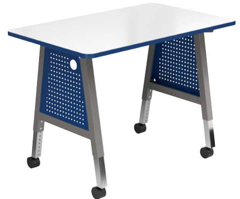
Markerboard Top with No Shelf