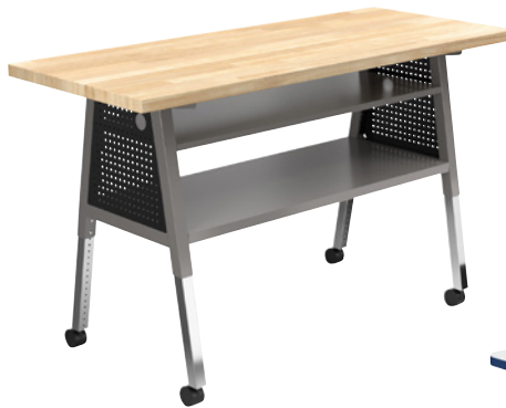
Butcher Block Top with Shelf