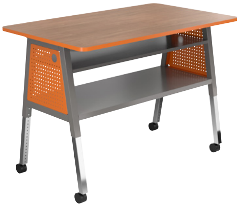
Laminate T-Mold with Shelf