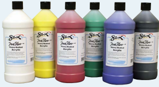
K-6 ART SUPPLIES Contract #123074

Save on all the products listed below, and thousands more.