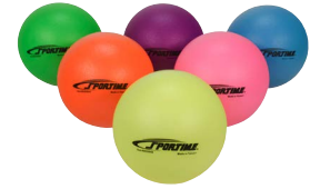
PHYSICAL EDUCATION SUPPLIES Contract #Q-124537

Paint, construction paper, ceramics, art pencils, markers