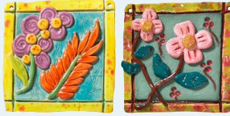
7-12 ART SUPPLIES Contract #Q-128348

Paint, construction paper, ceramics, art pencils, markers