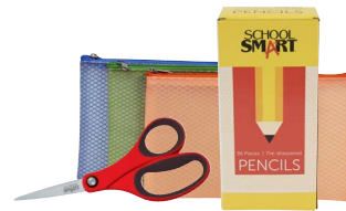
CLASSROOM & OFFICE SUPPLIES Contract #Q-125694

Lab supplies, robotics kits, biology, chemistry, earth & environmental science