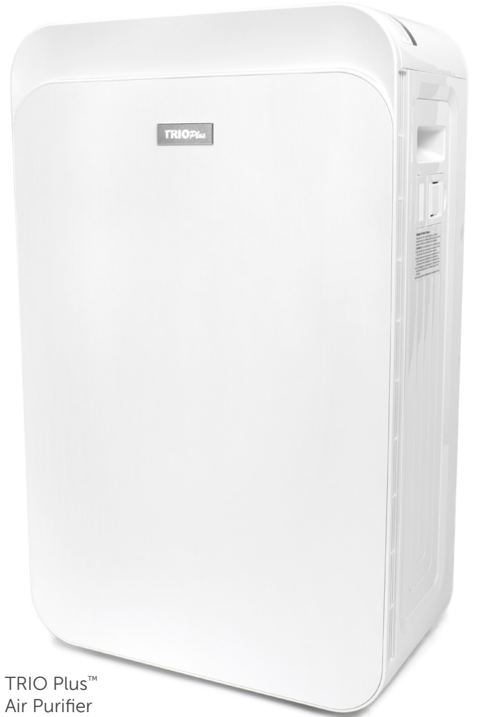
TRIO Plus™ Air Purifier Item #2083070

Sanitize even a spacious room with the high-capacity airflow and multi-stage filtration of the TRIO Plus™ UVC & HEPA Equipped Air Purifier. It cleans the air in a 775 square-foot schoolroom three times every hour. Three state-of-the-art technologies intercept airborne microorganisms and viruses with quiet efficiency, so learning can proceed without interruption.