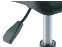
Pneumatic Adjustment from 24" to 34" and 38" to 48"