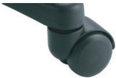
Includes 2" Diameter, Nylon Twin-Wheel Swivel Casters