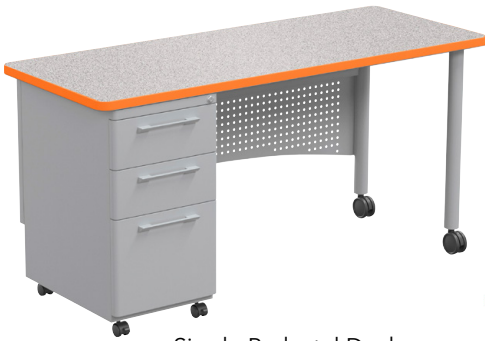
Single Pedestal Desk