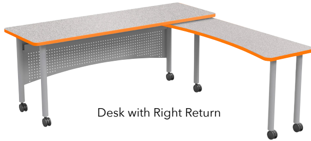
Desk with Right Return