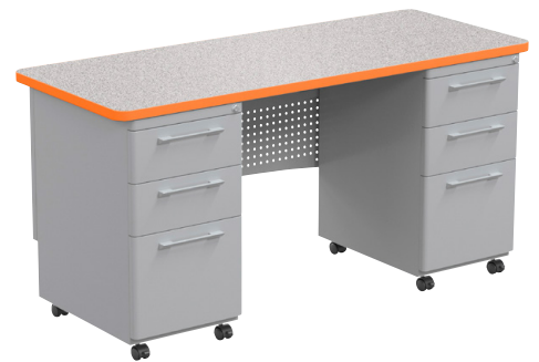
Double Pedestal Desk