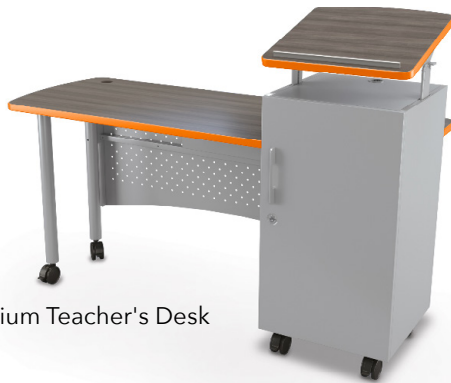
Podium Teacher's Desk