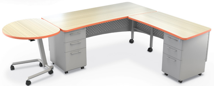
Right or Left Return Desk with Height Adjustable Conference End Table

Classroom Select® NeoClass® Mobile Teacher's Desks are offered in multiple configurations and provide a functional student-teacher meeting area. Add the adjustable conference end table for expanded meeting space or use it as a podium in the classroom or choose to shift between learning pods and student conferences with the easy to move compact Podium Teacher's Desk.