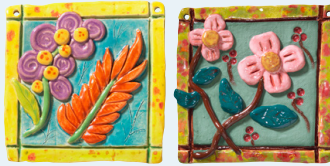
7-12 ART SUPPLIES Contract #Q-256781

Paint, construction paper, ceramics, art pencils, markers