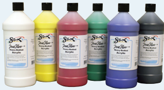
K-6 ART SUPPLIES Contract #Q-255153

Save on all the products listed below, and thousands more.