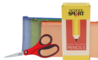
CLASSROOM & OFFICE SUPPLIES Contract #Q-257012

Lab supplies, robotics kits, biology, chemistry, earth & environmental science