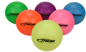
PHYSICAL EDUCATION SUPPLIES Contract #Q-250909

Paint, construction paper, ceramics, art pencils, markers