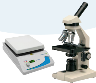
SCIENCE SUPPLIES Contract #Q-261392

Organization, playground & sports balls, health & wellness, fitness equipment